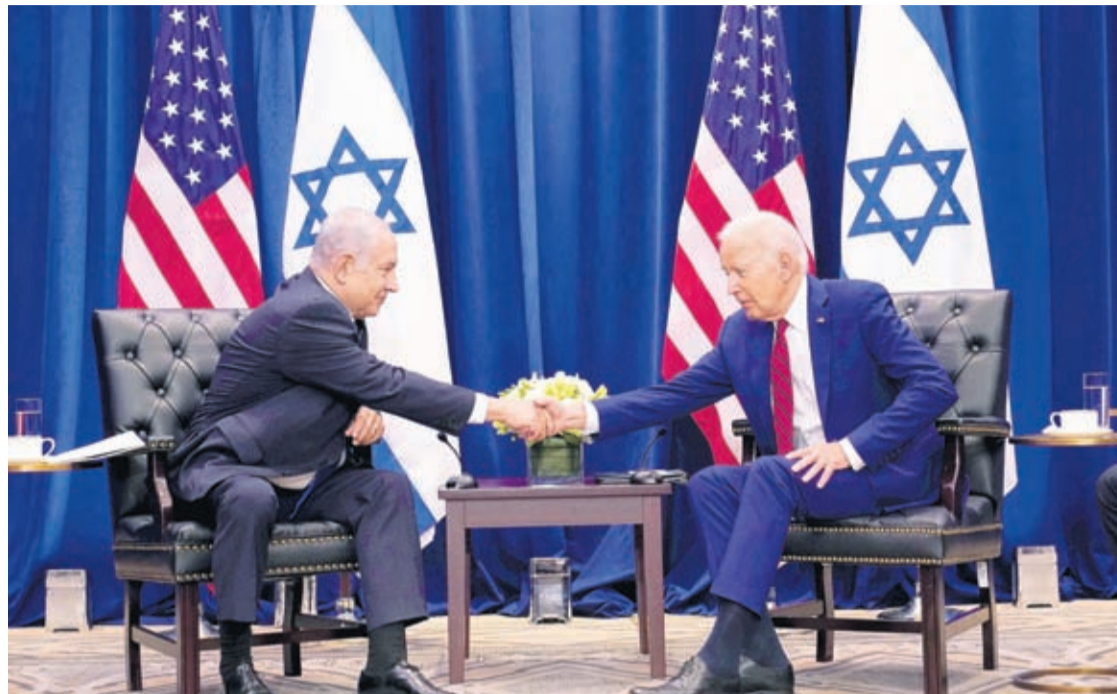
President Joe Biden meets with Israeli Prime Minister Benjamin Netanyahu in New York, Wednesday, Sept. 20, 2023.

Israel had been facing a Saturday deadline, the end of the U.S. government's budget year, to gain ad-